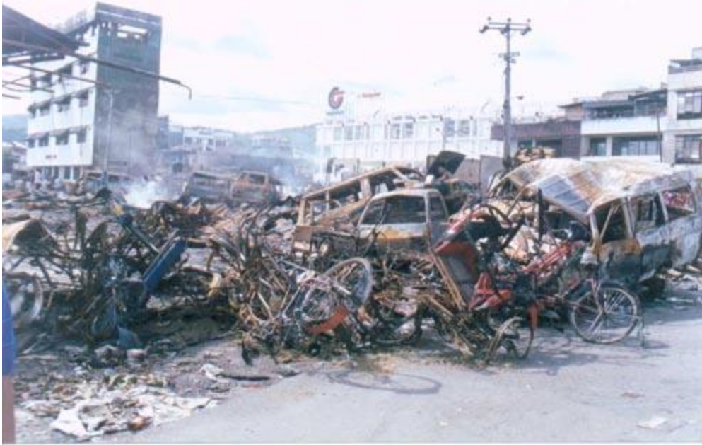
Photograph 1. Destroyed area of Gambus market, Ambon, Maluku