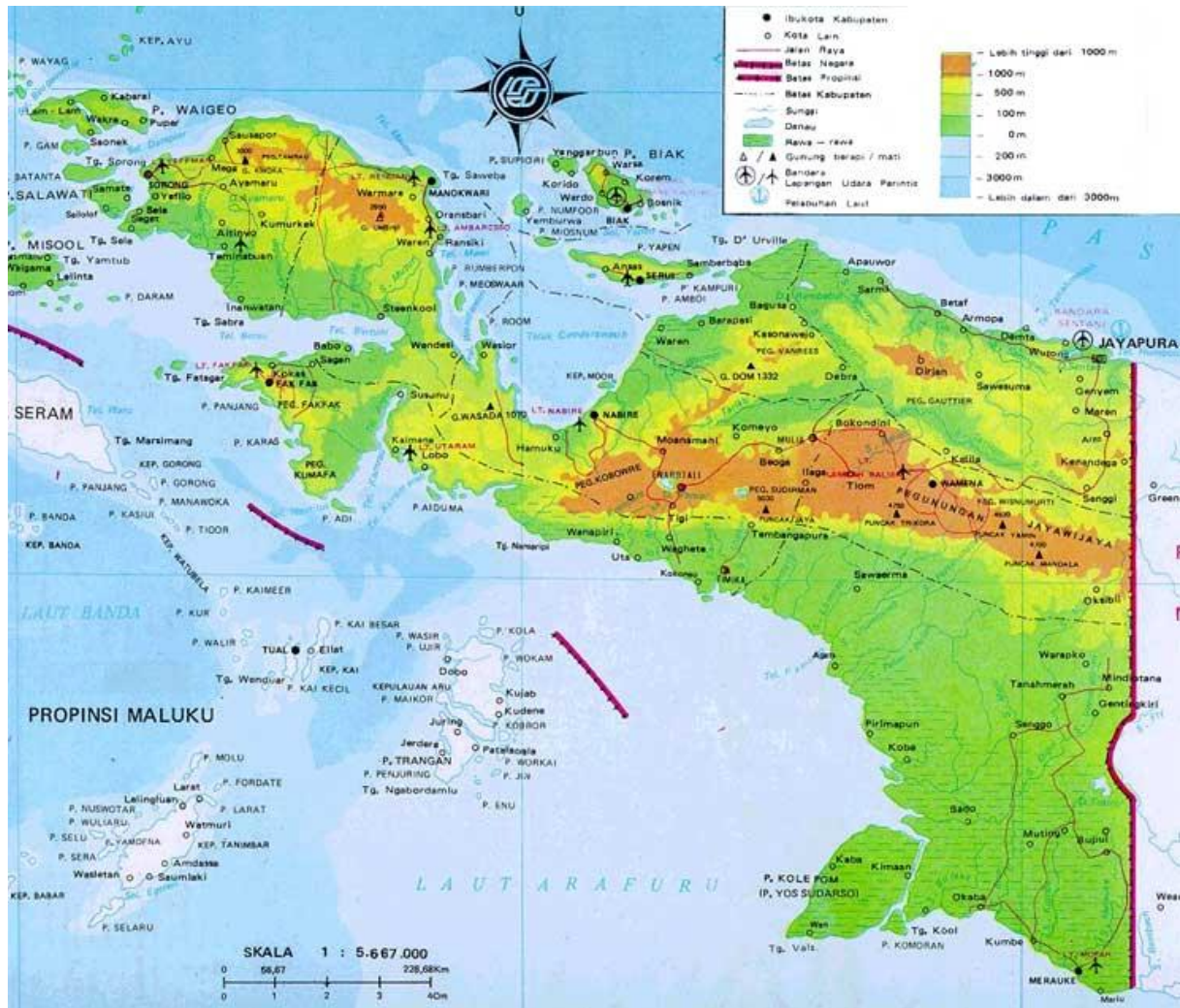
Map 2. Irian Jaya/West Papua