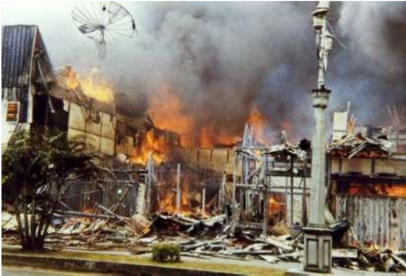
Photograph 3. Burning of the business center in AJ Patty Street, Ambon, Maluku