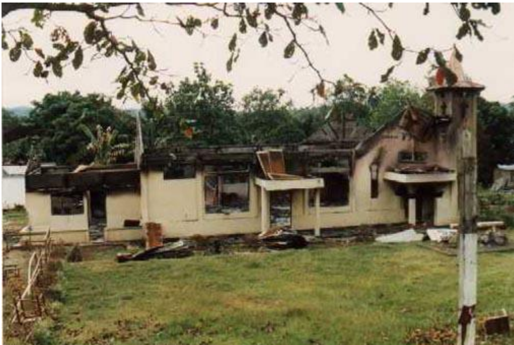
Photograph 2. Burnt church in Ambon, Maluku