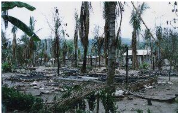
Photograph 4. A destroyed village in East Timor.