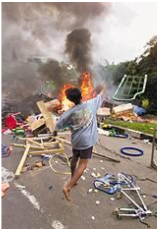
Photograph 5. A rioter in Lombok.